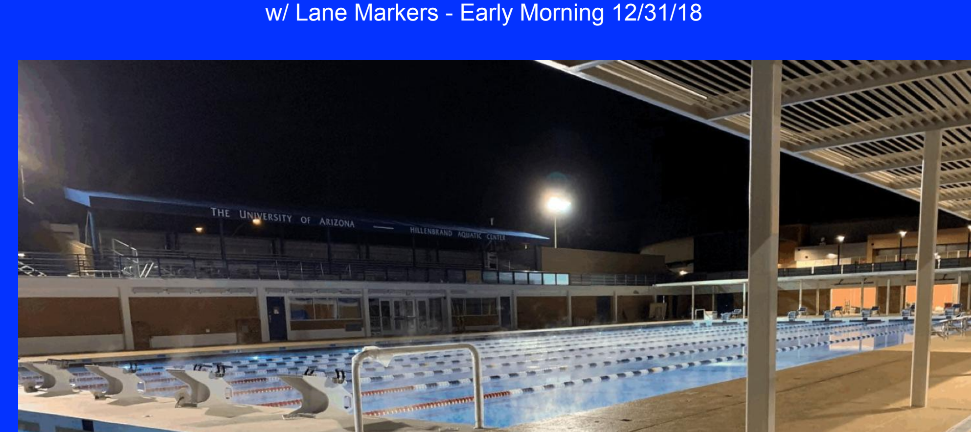
Hillenbrand Aquatic Center 50 meter Course w/ Lights & Fog - Early Morning 12/31/18