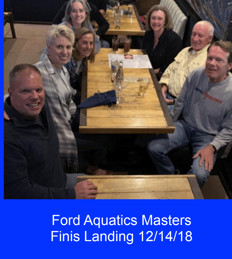
Ford Aquatics Masters Finis Landing 12/14/18