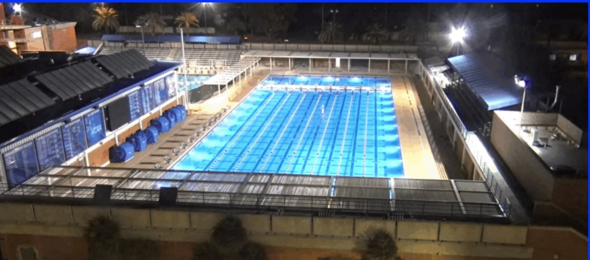
Hillenbrand Aquatic Center 50 meter Course w/ Lane Markers - Early Morning 12/31/18