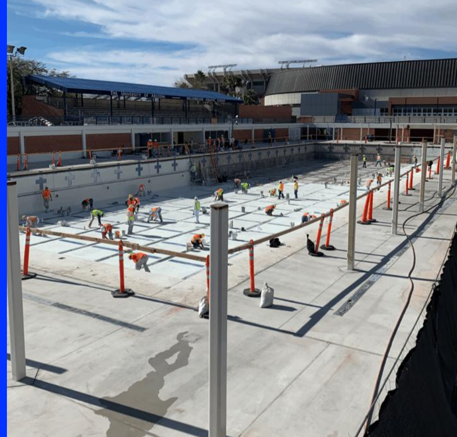
Hillenbrand A.C. Construction December 12, 2018