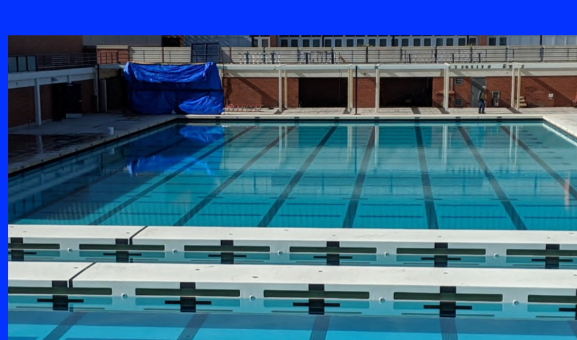
Hillenbrand Aquatic Center 12/17/18 Bulkheads 1 & 2 Have Landed!