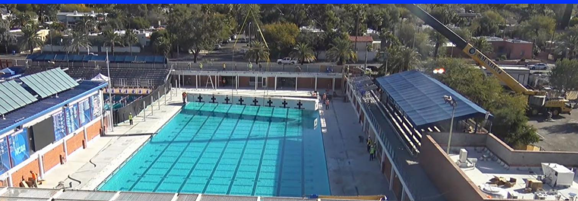
Hillenbrand Aquatic Center Construction 12/17/18 Bulkhead #1 Lowering Into Pool