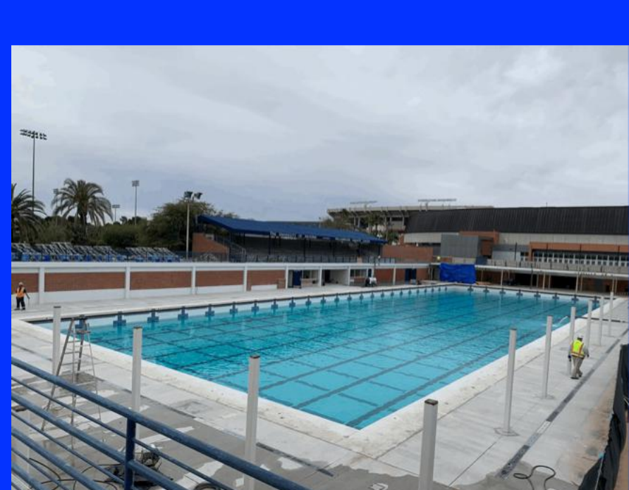
Hillenbrand A.C. - Almost Full !!! December 15, 2018