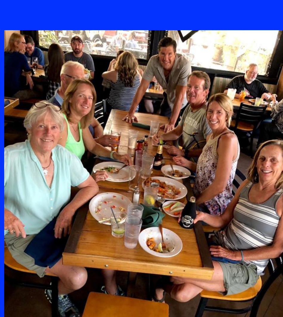
Fini's Landing - September 13, 2019