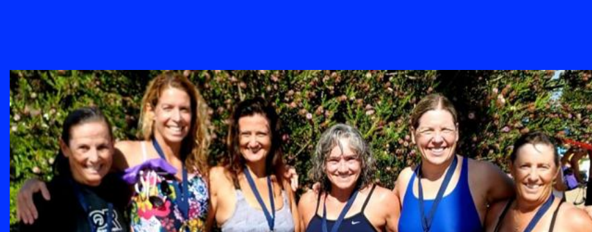
Site of USMS SC Yards Nationals - San Antonio, TX April 23-26, 2020