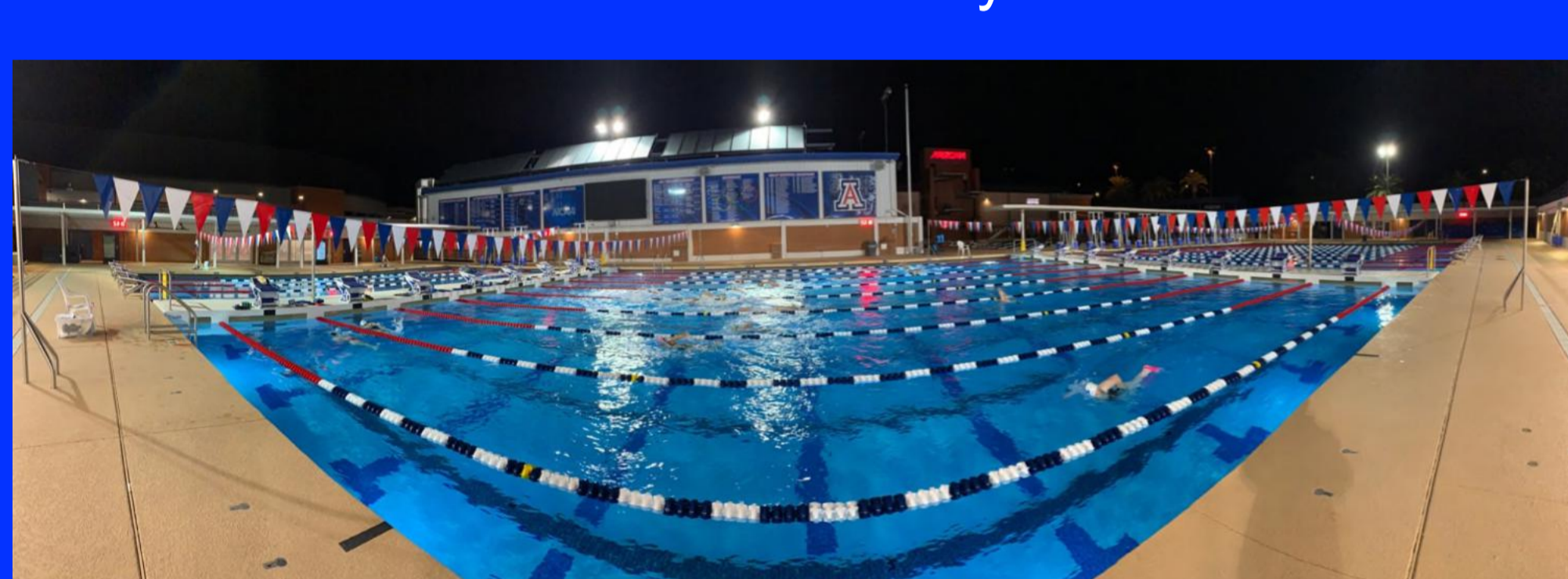
The New Pool February 1, 2019