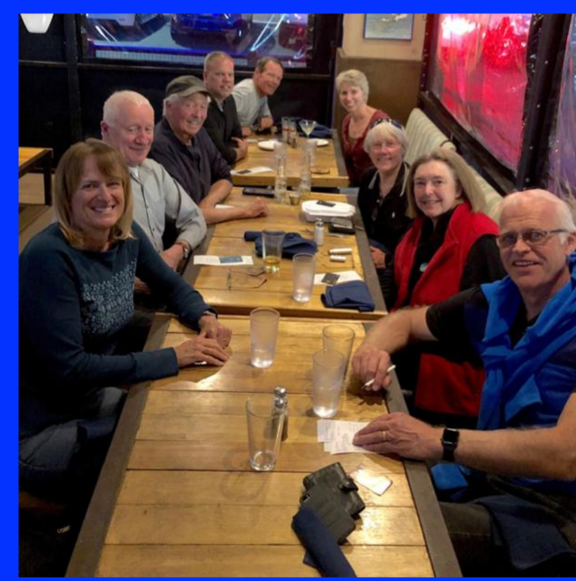
Fin's Landing February 8th