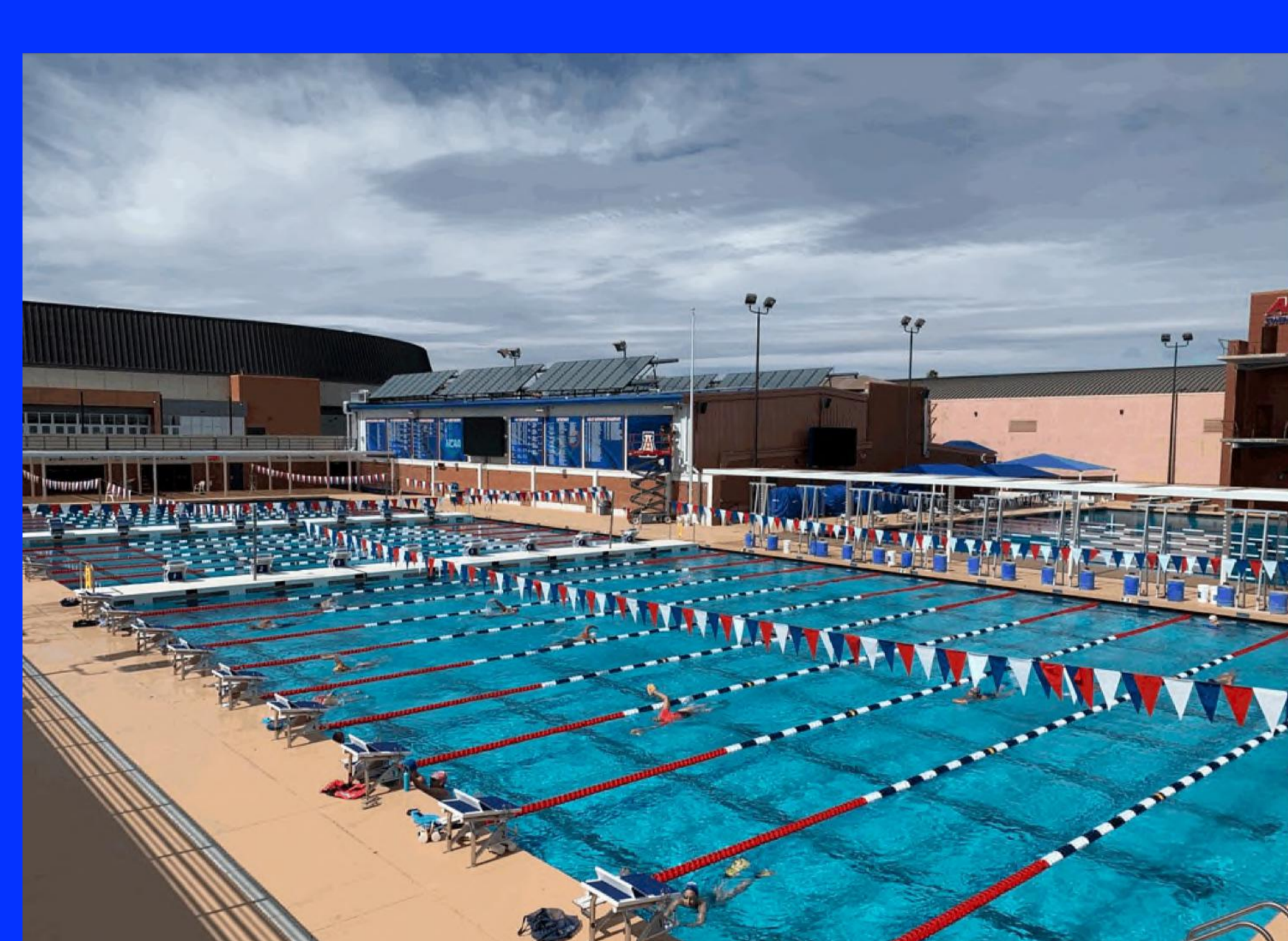
Another Beautiful Day at Hillenbrand Aquatic Center