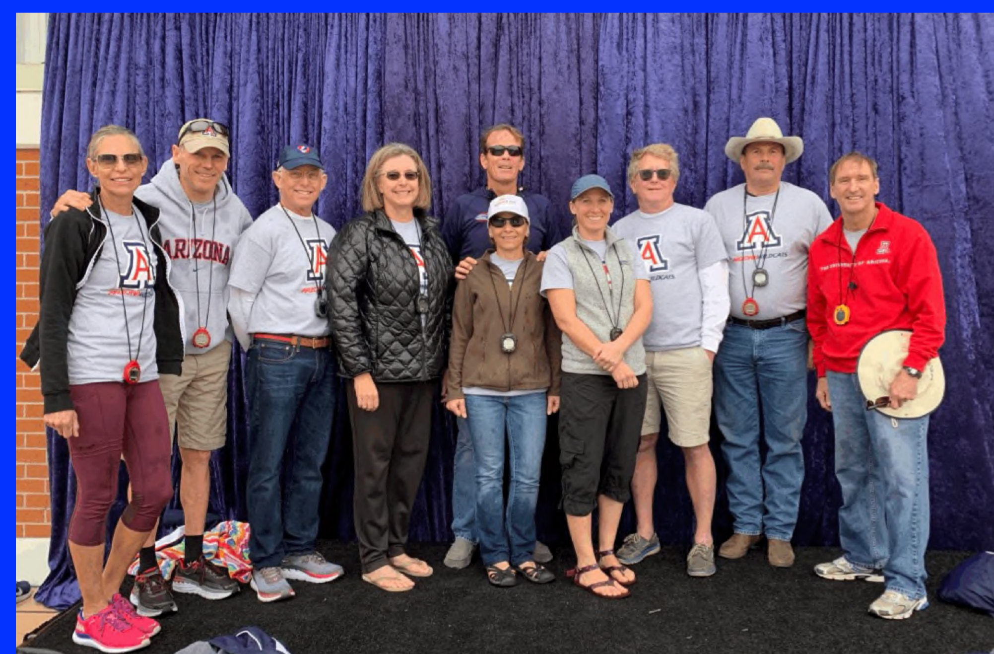
Timers - UA vs. ASU 2/9/19