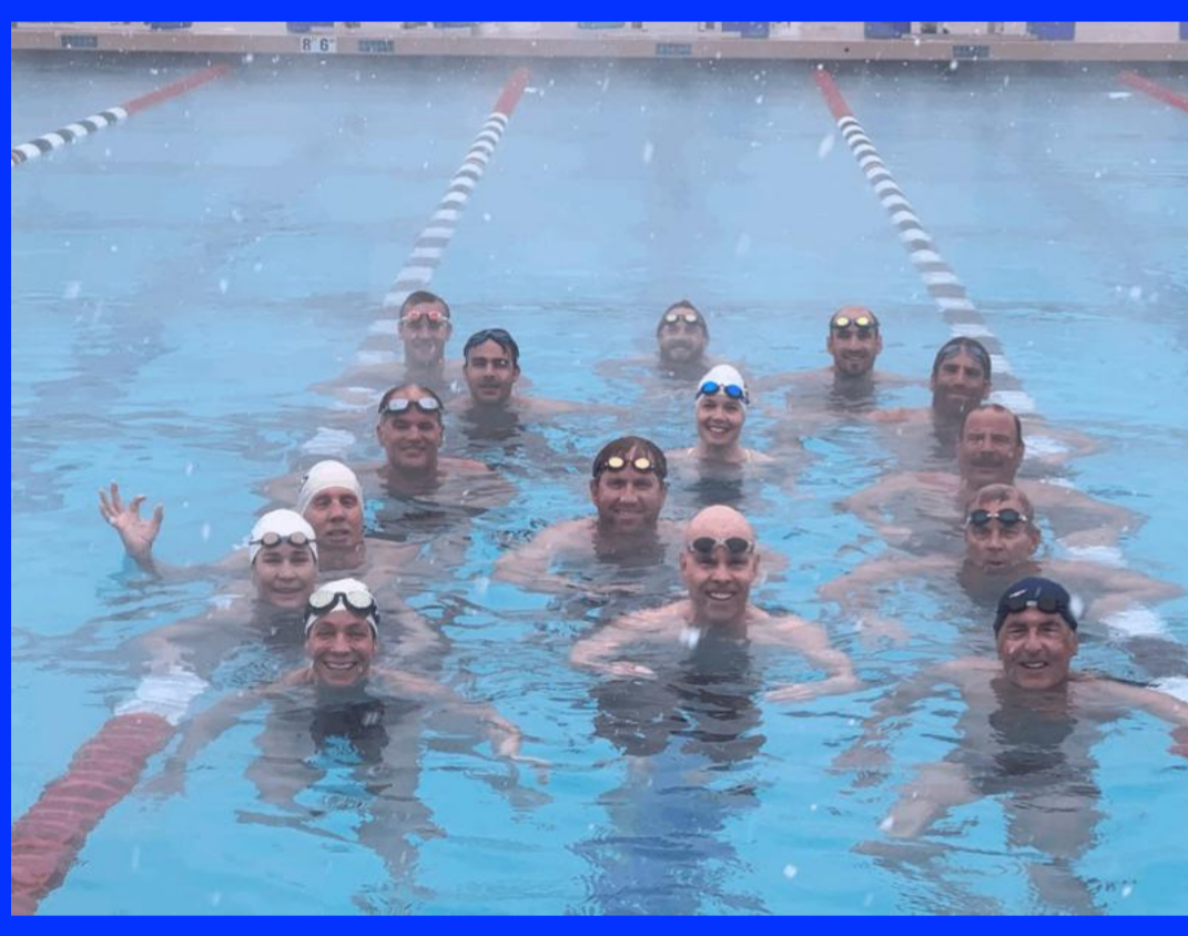
Snow Day @ NOON!!! February 22, 2019