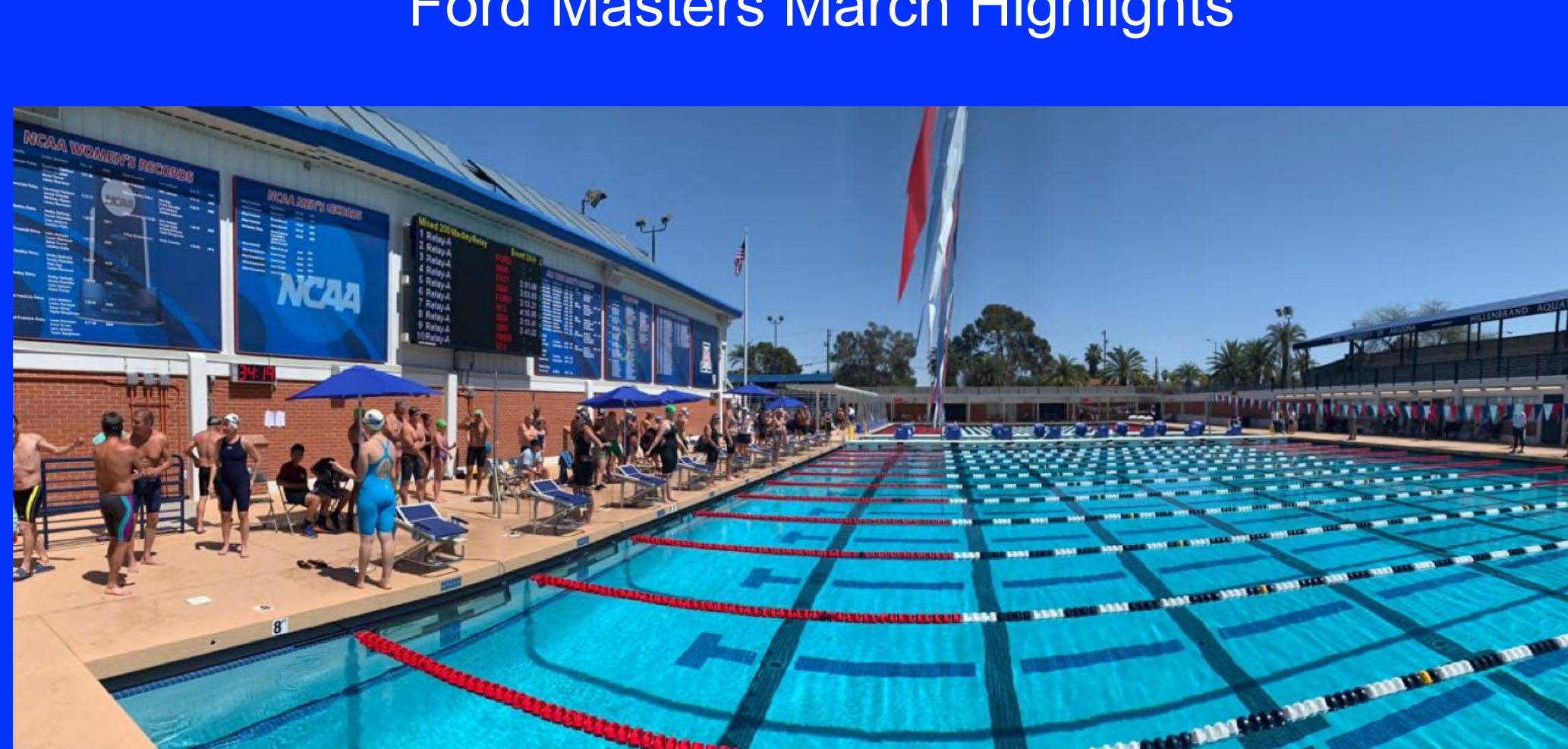
Hillenbrand Aquatic Center - SCY State 3/31/19