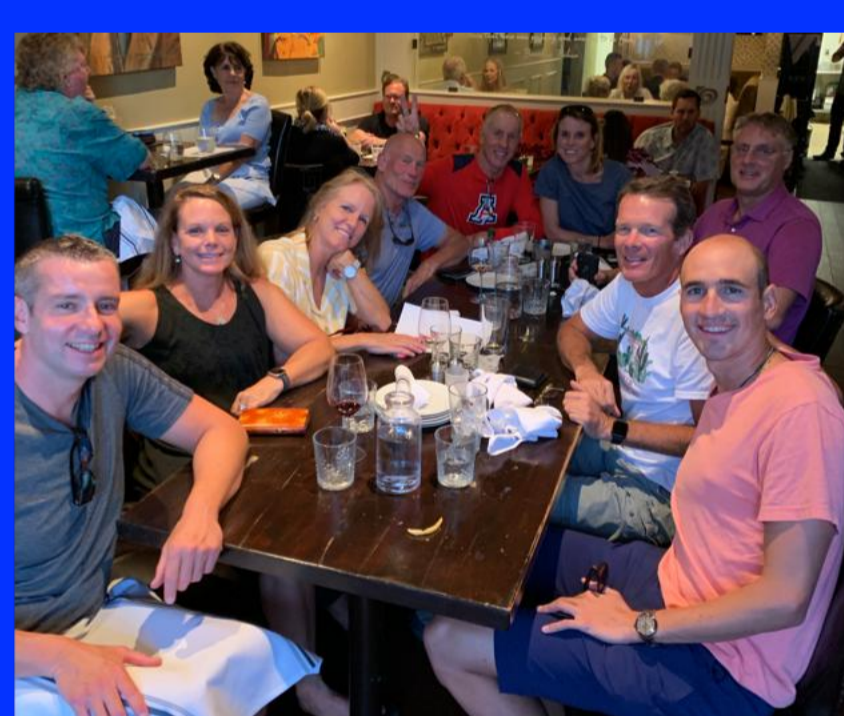
Team Night Out - Dinner @ Dublin 4 Mission Viejo, CA