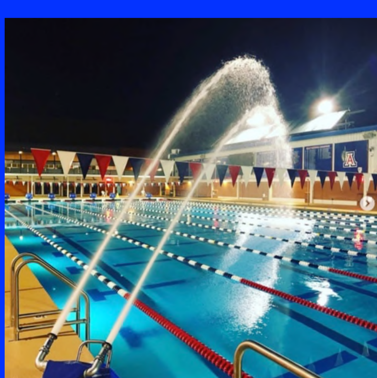
Home Sweet Home 8/30/19