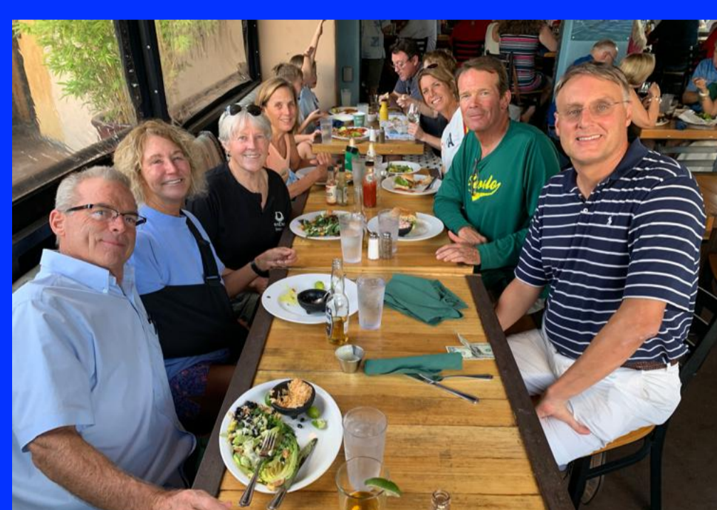
Celebrating Our Return To Hillenbrand AC on Monday Finis Landing 8/16/19